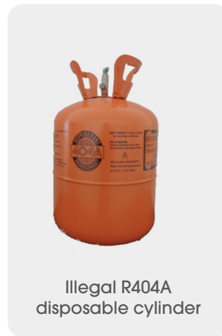
Illegal R404A disposable cylinder

Most illegal cylinders are disposable and can be identified like this..