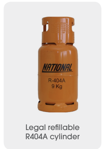
Legal refillable R404A cylinder

As disposable cylinders are illegal in Europe it is almost certain that the refrigerant inside will also be illegal non F-Gas compliant with no quality control.